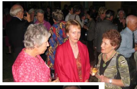
Members enjoying conversation/supper after Lecture